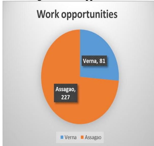
Figure:3 Work Opportunities

The success of incubation centre can be measured in terms of the incubatees graduated from CIBA. Start-up nurtured by CIBA have grown and earned high success. The list of few names provided below mentions the successful start-ups: